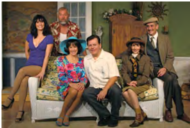
Anybody for Murder November – December 2009

We began 2010 with ... do you remember which show it was? It was very funny ... Well, they're ALL hysterical!