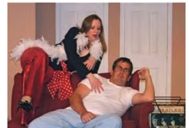
The Owl and the Pussycat July – August 2009