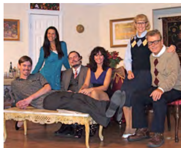
How the Other Half Loves November – December 2010