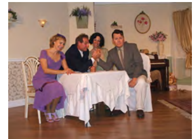
Private Lives April – June 2009