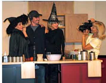
The Kitchen Witches July – September 2010

Then, we brewed up a little something special for the summer of 2010!