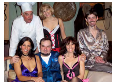
Don't Dress for Dinner April – June 2011