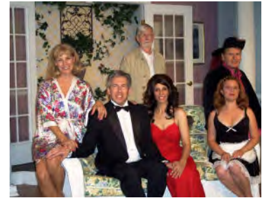
Pajama Tops July – September 2007

Let's see ... what's next? Ah, yes, our summer show in 2007!