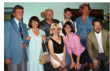
Never Kiss a Naughty Nanny November – December 2007