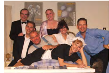
Natalie Needs a Nightie February – April 2009