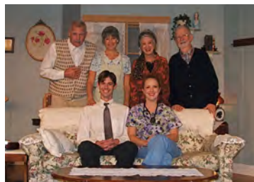
Over the River and Through the Woods November – December 2008