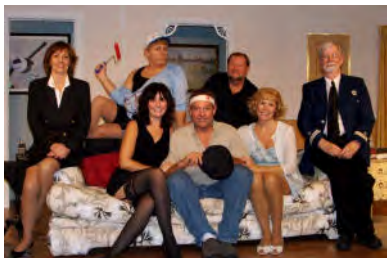
Run for Your Wife March – April 2008

March of 2008 was when we began our EBDT Newsletters!