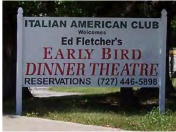
Early Bird Dinner Theatre At the Italian American Club

Was it really back on September 7 th of 2006 that we opened our first production at the Italian American Club location? Time flies! Join us for a little trip down memory lane and all that has occurred over the past 5 years.