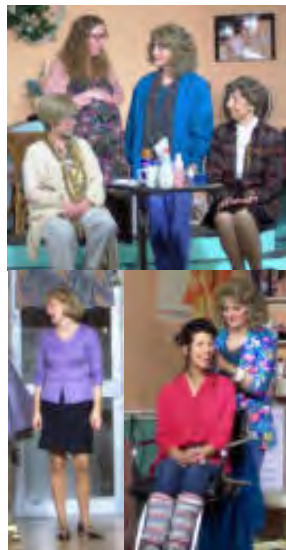
Steel Magnolias February 2007 – April 2007