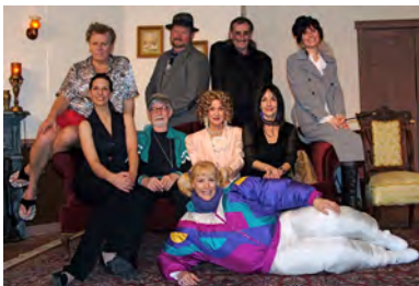
Death by Chocolate March – April 2010