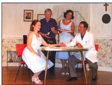
Rich is Better April 2008 – June 2008

March of 2008 was when we began our EBDT Newsletters!