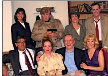
Funny Money April – June 2010

How did we ever go on? Ah, the love of live theatre and our patrons keeps us going!