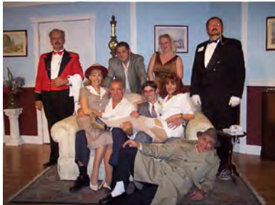
Out of Order January – February 2008

Lets move on to 2008 and beyond. There's more memories and laughter to share! Are you recognizing some familiar cast members yet?