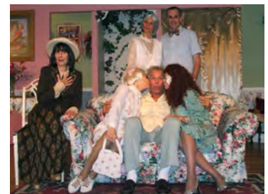
Sex Please, We're Sixty! March – April 2011