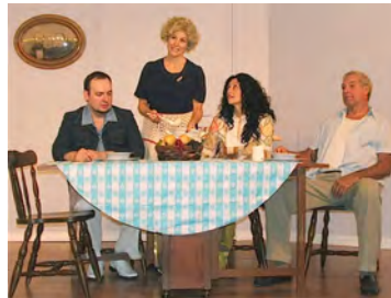
Lovers and Other Strangers September – October 2010