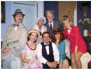
That's right! Our FIRST SEASON at the IAC was ...

Does anyone remember that very first show? Here's a hint for you: