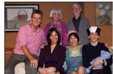
Squabbles September – October 2009