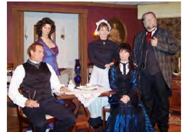
Angel Street September – October 2007

We opened our SECOND SEASON with a drama! How daring of us!