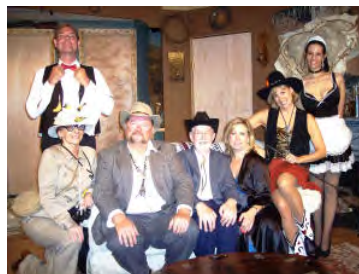
The Lone Star Love Potion April – June 2007