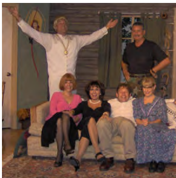
You're right again! Sin, Sex and the CIA November – December 2006

How about the next one? Oh, okay. We'll give you another hint: