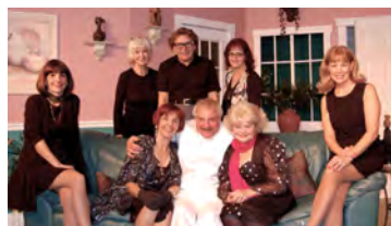
Bermuda Avenue Triangle January – February 2009