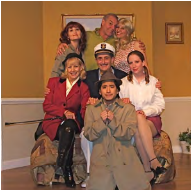
There's a Burglar in my Bed January – February 2010

We began 2010 with ... do you remember which show it was? It was very funny ... Well, they're ALL hysterical!