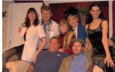
Key for Two December 2006 – February 2007

We can see that you're pretty good at this! So, how about a pictorial journey down that memory lane?