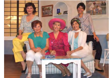
The Dixie Swim Club January - February 2011