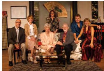
Social Security September – November 2008